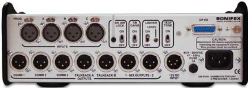
Fig 3-2: Rear Panel View Of CM-CU21

The rear panel of the Commentator Unit carries the four return audio inputs and all comm., talkback and mix output connectors. Four additional controls are located on the rear panel; On Air Lock, Talkback Gang, Limiter and Test Tone.