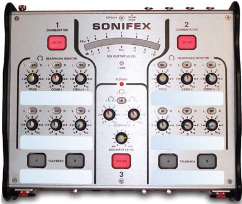
Fig 2-1: Top Panel View Of CM-CU21

The main or top panel of the Commentator Unit is split into four areas. To the left and right are the main commentator position controls, with the third commentator/guest position controls located in the centre, below the power indicator, mix output limiter active indicator and the PPM meter display.