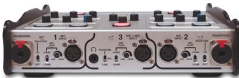
Fig 3-1: Front Panel View Of CM-CU21

The front panel of the Commentator Unit has all of the commentator inputs and headphone outputs as well as the microphone power and gain controls.