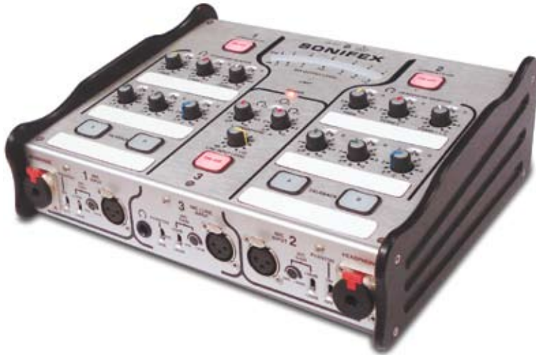
Fig 1-1: CM-CU21 Commentator Unit

The CM-CU21 Commentator Unit is a high quality, portable broadcast mixer and 4-wire talkback unit. Its sturdy construction and flexibility of features make it suitable for use in a wide variety of environments.