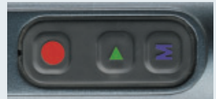
FlashMic screen and on-body controls