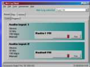
Net-Log-Win record screen