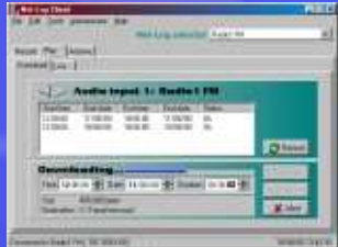
Net-Log-Win play screen